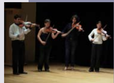
Summer Academy 2007