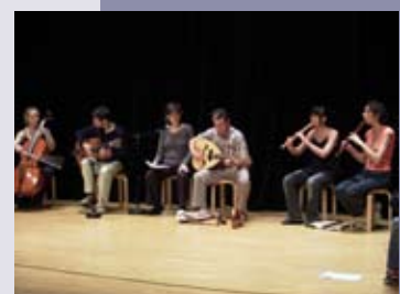
Summer Academy 2007