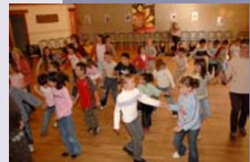
Artists in Residence 2006